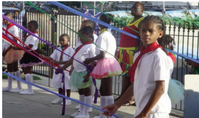
YOUTH AWARD St. Albans Episcopal Church - Guyana Rally of the Nations (Maypole)