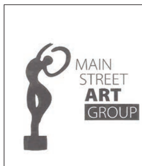
GCA AWARD Main Street Art Group